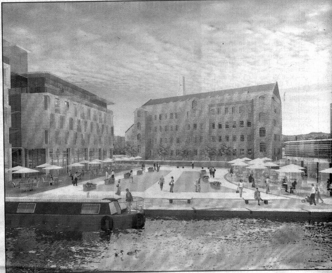
■ NEW LOOK: An architect's drawing of the latest ideas for Huddersfield's Waterfront Quarter

The revised planning application features nearly 300,000sq ft of modern offices and 460,000sq ft of residential flats.